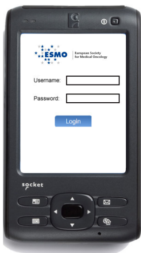
Log in screen